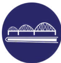
Greater Albany Public Schools