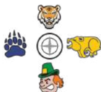
Lincoln County School District