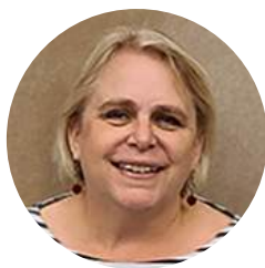
Sonya Hart Special Education and Evaluation Services