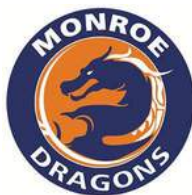
Monroe School District